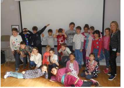
Dressing up *Learning and Happiness through Creativity