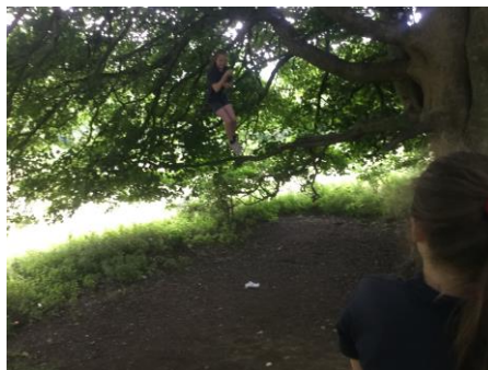
Can you see me?