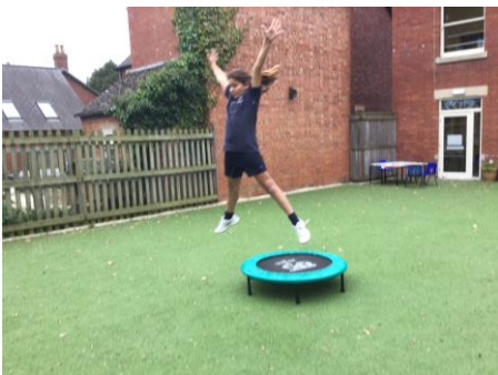
Star jumps with a twist